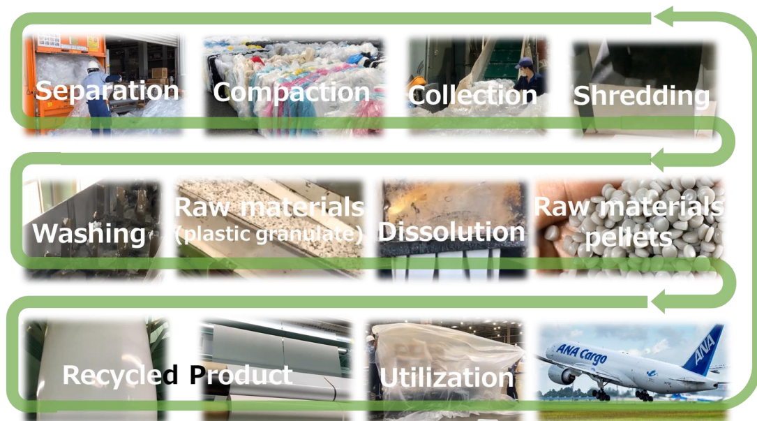
[Joint recycling operation with ANA Holdings Inc.]